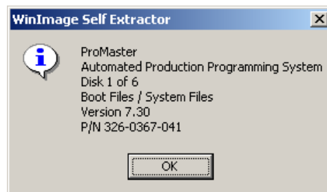
Status window describing disk contents