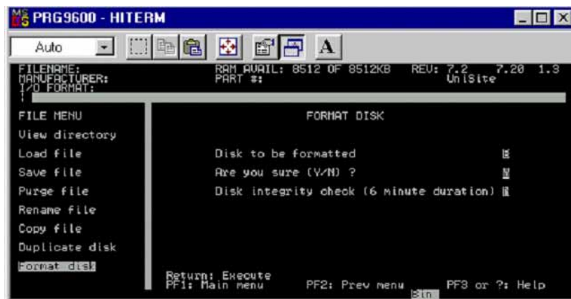
FORMAT DISK screen