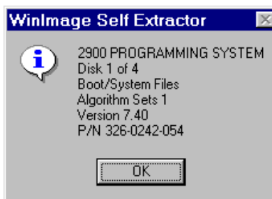
Status window describing disk contents