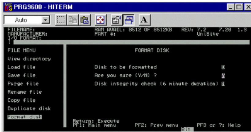
FORMAT DISK screen